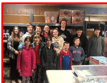
Kidzz Helping Kidzz working at the pantry!