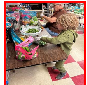
One of our littlest helpers, hard at work.