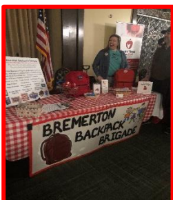
Non profit showcase We WON first prize as most popular!