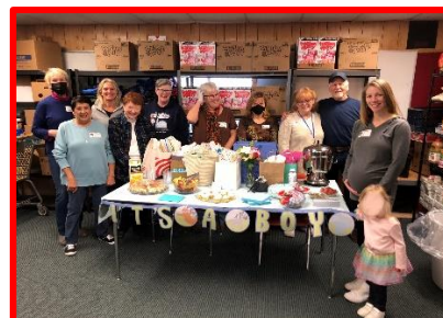
Surprise baby shower for one of our faithful Wednesday crew.